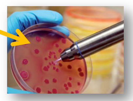
Plasma device (kinpen) produced by neoplas, Greifswald

Specialty Pharma produced by Riemser, Greifswald